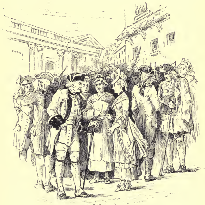
'Groups of people, of all ranks, talking of Sir Ulick O'Shane's bankruptcy.'

his way to one of the barred windows. There was a place where notes were handed in and accepted , as they called it, by the clerks, who thus for the hour soothed and pacified the sufferers, with the hopes that this acceptance would be good, and would stand in stead at some future day. They were told,